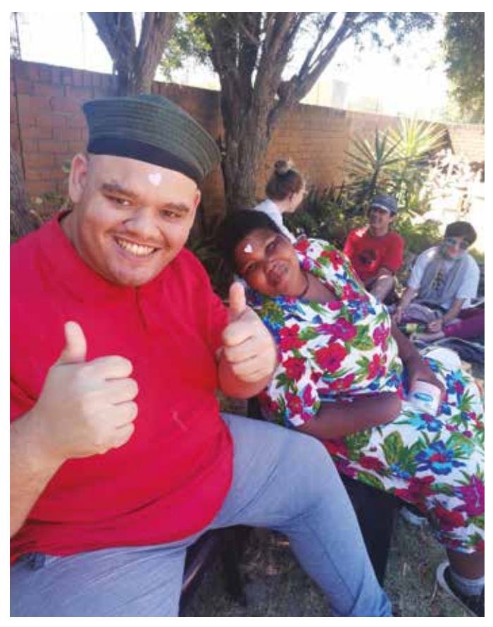
Valentine's Karaoke and braai