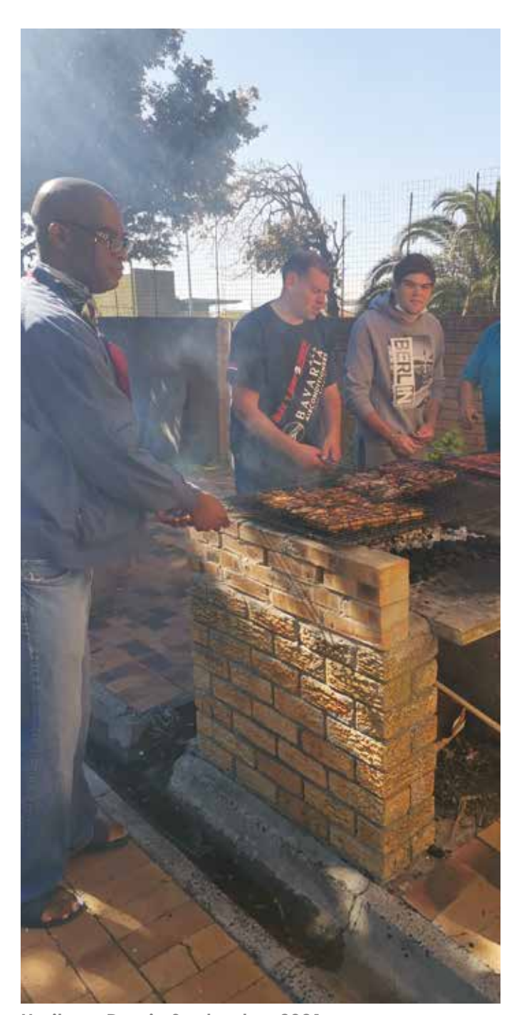
Heritage Day in September 2021

After all clinic follow-ups and Hospital visits were prohibited during Covid, this year we returned to accompanying residents to their appointments and follow-ups and being able to provide optimal interventions in terms of their health and well-being.