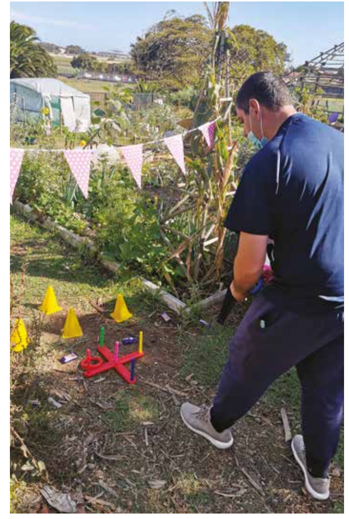
An easter egg hunt at OC in April 2021.

In 2021 we re-started smaller and later larger groups like our functions and outings followed by the middle of the year. These joyous occasions where residents can socialise, be stimulated, and engage with the outside world included: