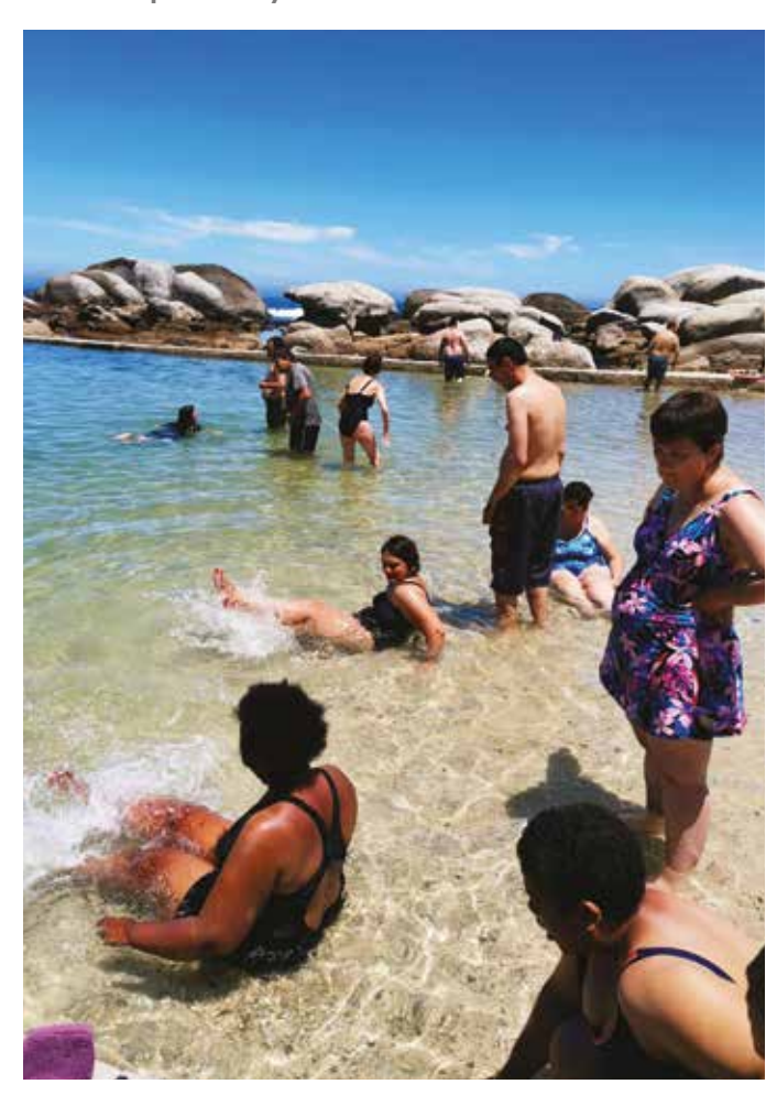
Maiden Cove Outing on 9 December 2021.