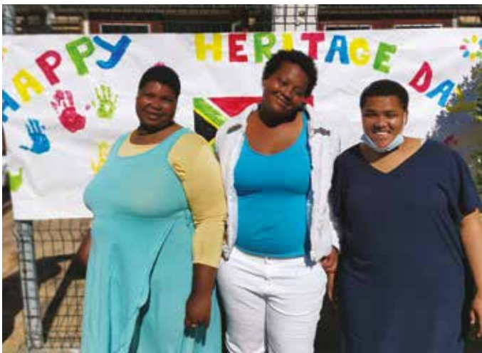
A visit to the statues at Canal Walk in celebration of Heritage Day.