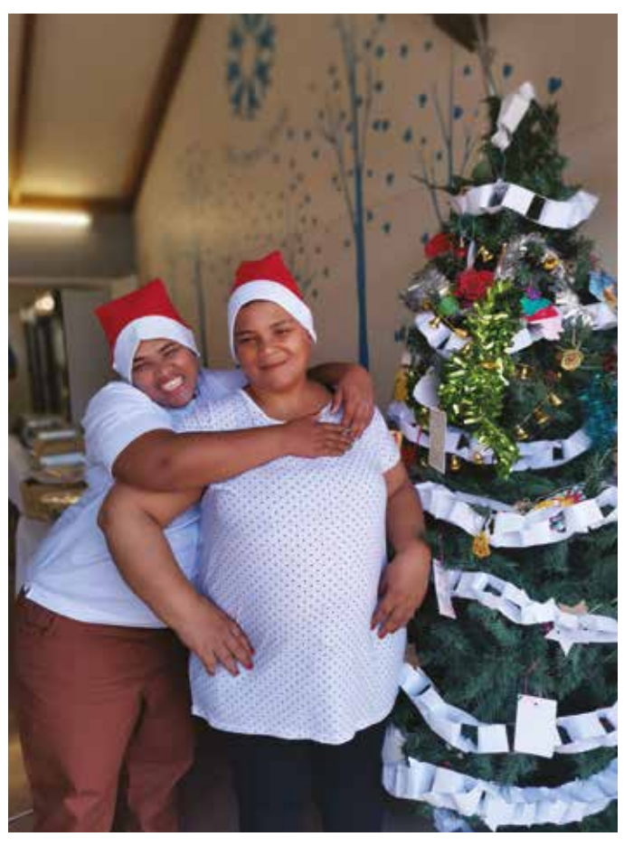
Family day was back for the first time in 2 years on 16 December 2021, though numbers were limited.