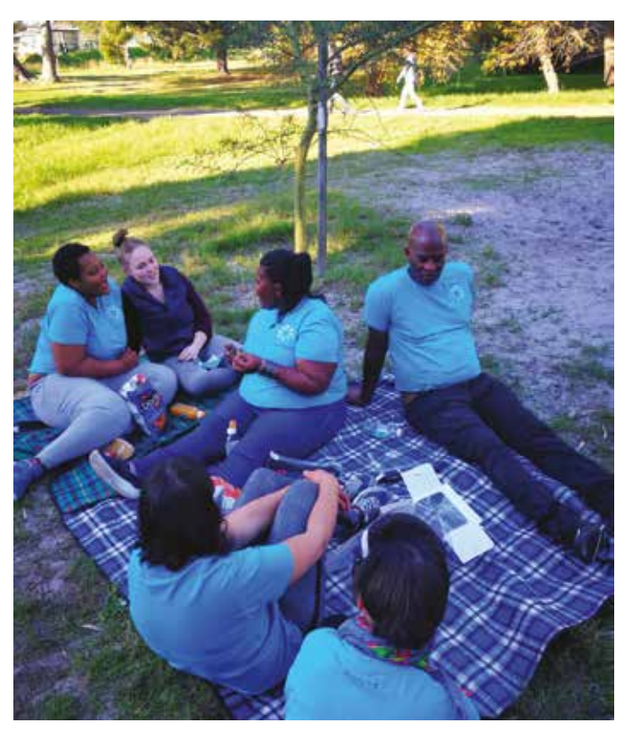
A small outing to Keurboom Park to celebrate Keurboom Rotary's 31<sup>st</sup> birthday.