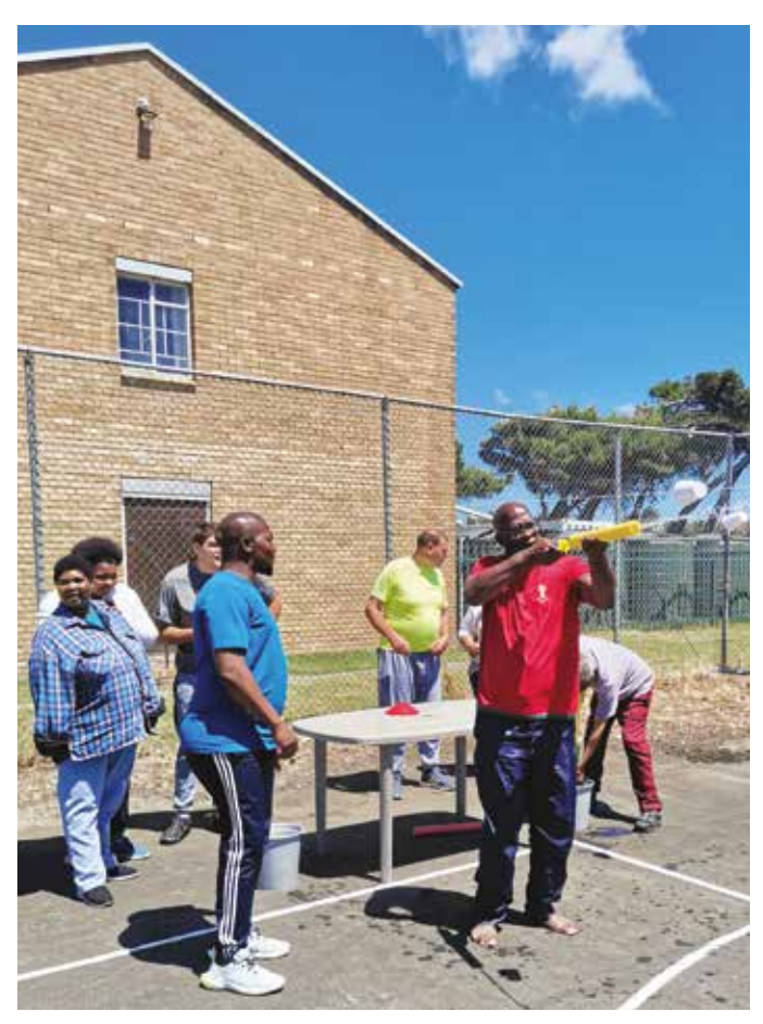
Annual Sports day in November 2021.