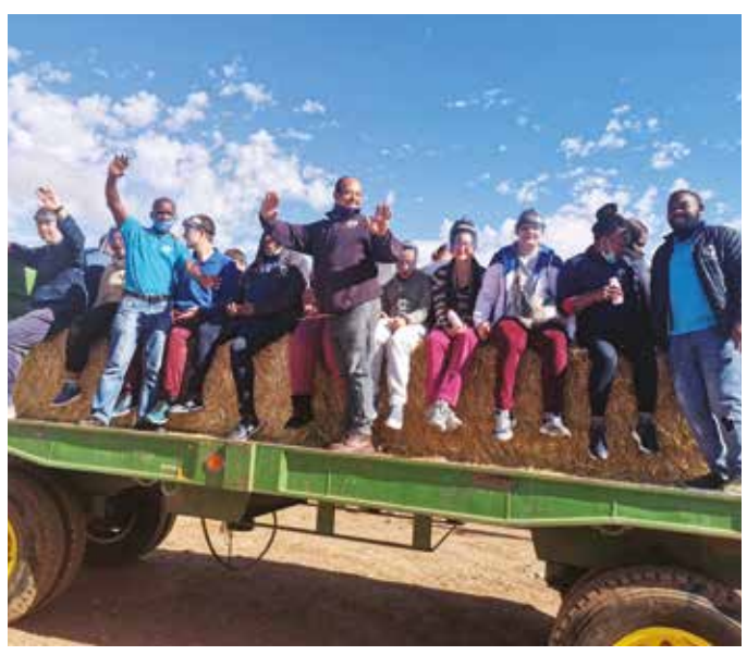
A Visit to Saamstaan Dairy in Malmesbury during May 2021.