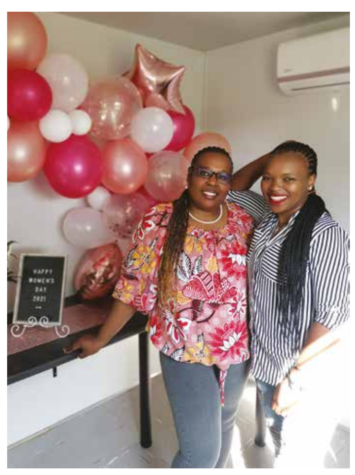
Woman's day celebration in August 2021