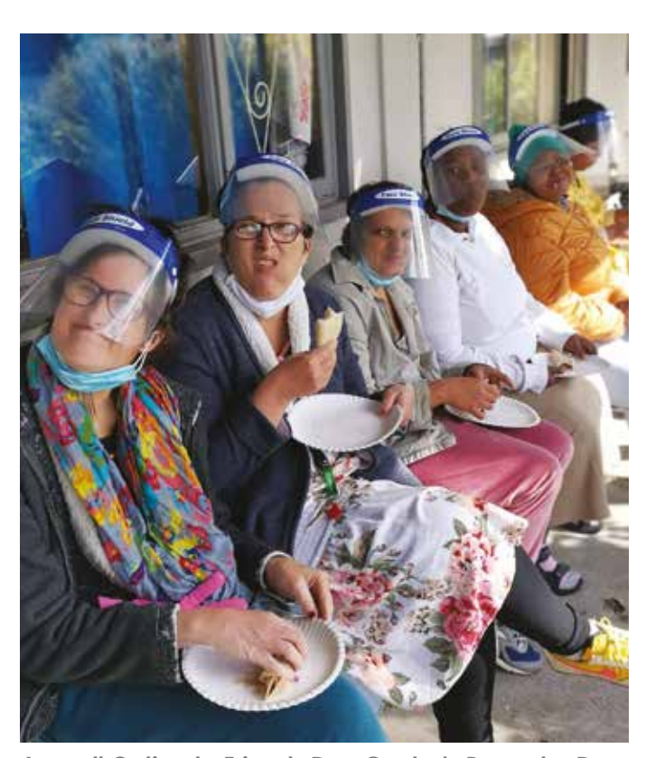
A small Outing to Friends Day Centre's Pancake Day.