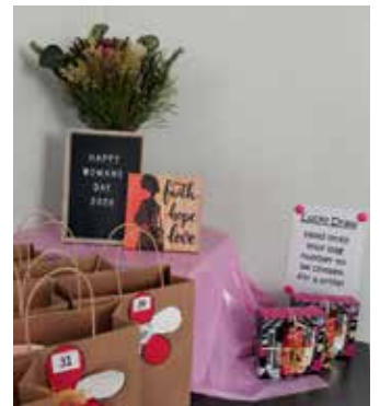
Woman's day 2020: An ex-colleague and then Beauty Salon owner, generously provided a mini-spa day for our ladies! (above); Heritage Day 2020 (below).