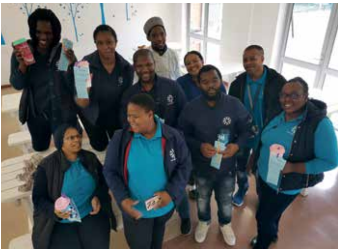
Nurses day May 2020 (Above)