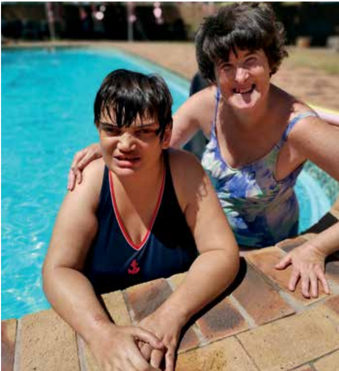
Friends swimming together