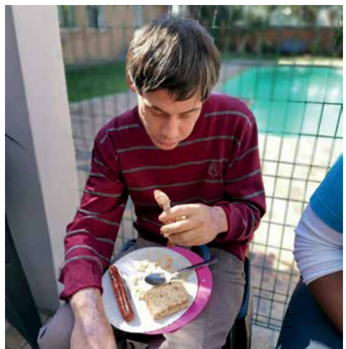
This year we made sure residents and staff had a braai once a month over a weekend.