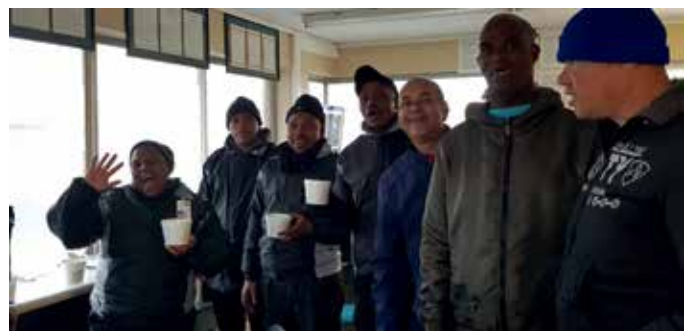
The Open Circle also gave back this year for Mandela Day and served soup to some of our friends on the Alexandra estate.