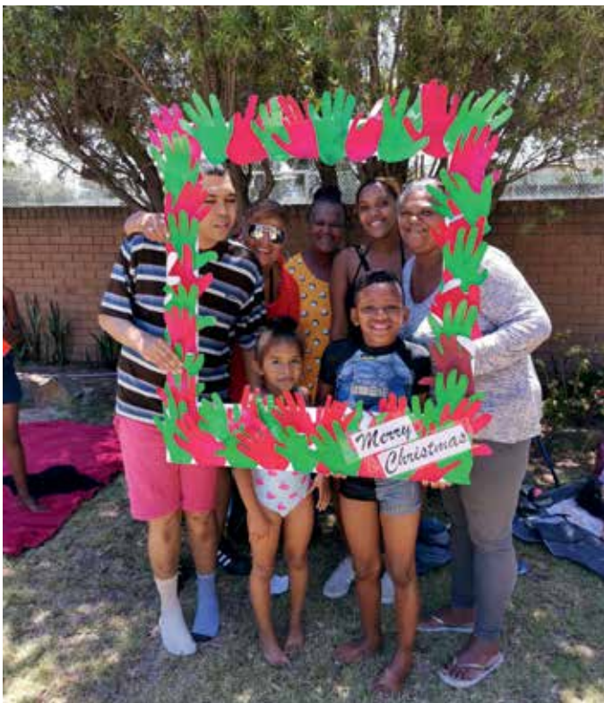
Our Family Day on 16 December 2019 was once again well-attended by 70 family members and it was a wonderful day. OC believes that the family is a part of our Team and we value their input and support.