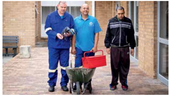
Helping with Maintenance