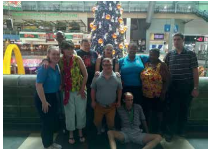
An outing to Canal Walk to spend our wages.

Below you will find some pictures of more special events this past year.