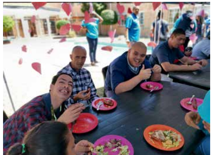
Valentine's day was special. We had an outside Karaoke/Braai and swimming afternoon.