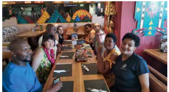
We are grateful to the Spur in Canal Walk for providing staff and residents with a free meal.