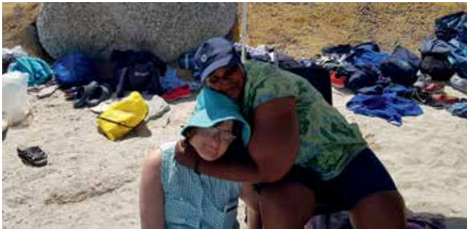
We had a great picnic at Maiden's Cove in October 2019.