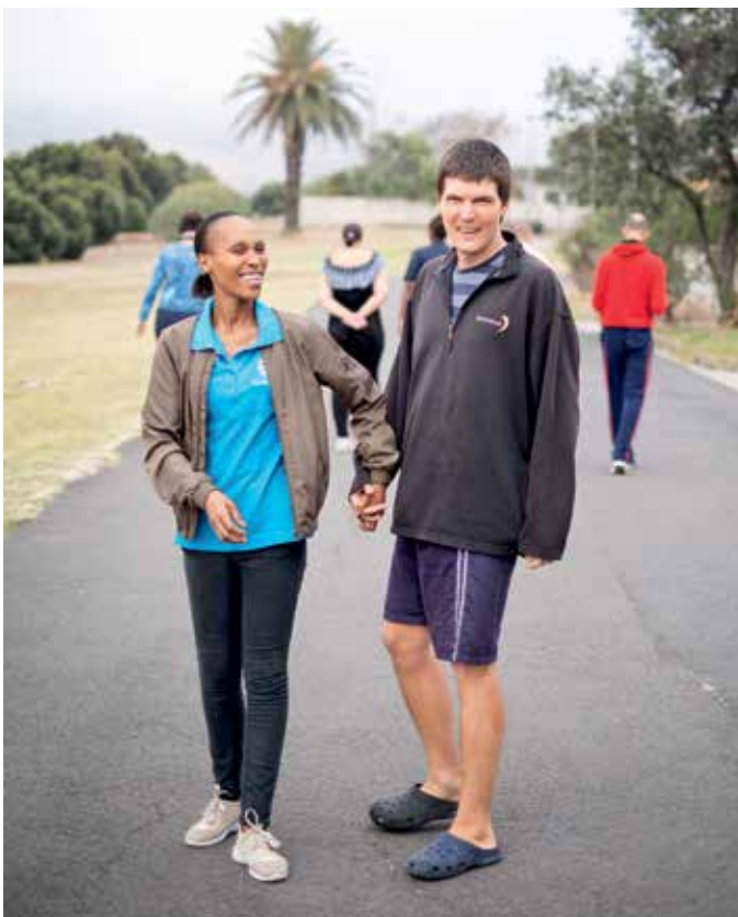
We enjoy walking every day!