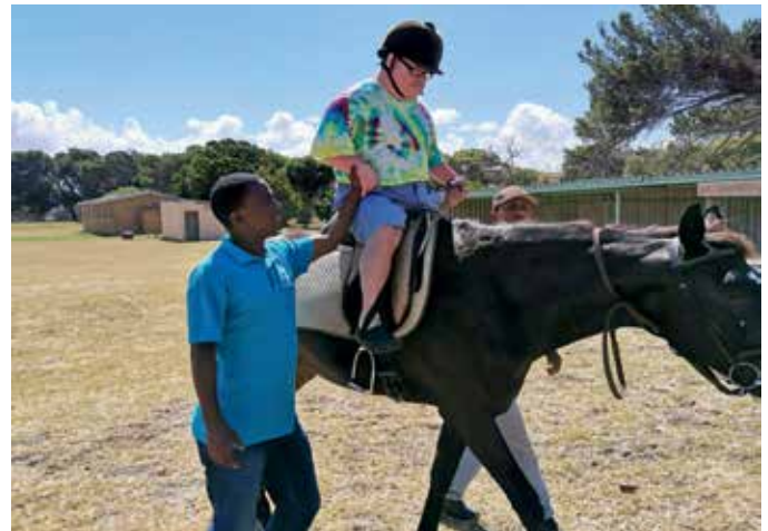
In January 2020 some of our residents joined the holiday programme at Alexandra Hospital for horse riding and a Pool Party hosted by The Open Circle.