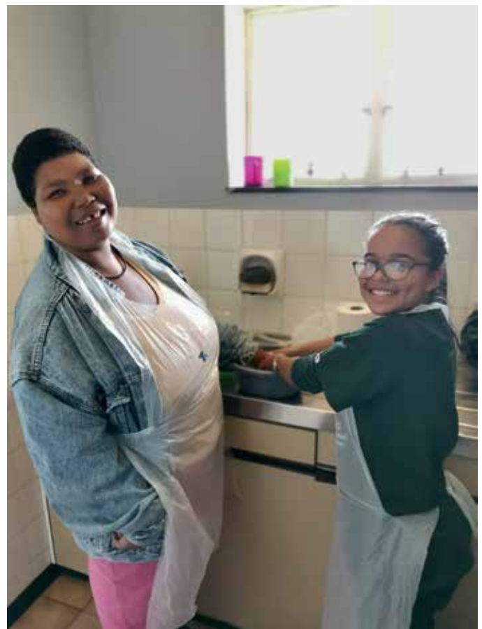
Here is an OT student working with one of our residents.