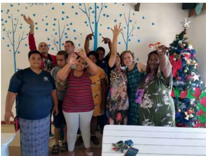
Not all residents could be with family for Christmas 2019, so we made sure the day was memorable with their OC family.